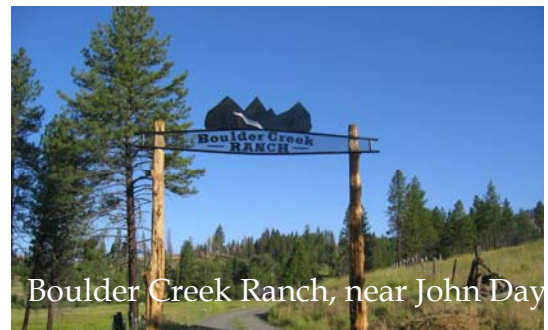
Boulder Creek Ranch, near John Day

There is something about the relationship that gals have with their horses, sometimes dogs, and definitely with their girlfriends! Eastern Oregon is a great 'getaway' for women and their favorite things. Look at combining a horse back experience, with the pleasures of the many fine B&Bs in the region, that cater to accepting dogs and horses.