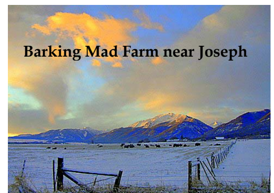
Barking Mad Farm near Joseph

(Joseph, Oregon) Nestled in the far northeast corner of Oregon is a place of awesome beauty, a deep heritage, and a rich culture of artists and ranchers. The Wallowa Valley was the home of Chief Joseph and was revered by him as a sacred 'Homeland'. It is a place where the